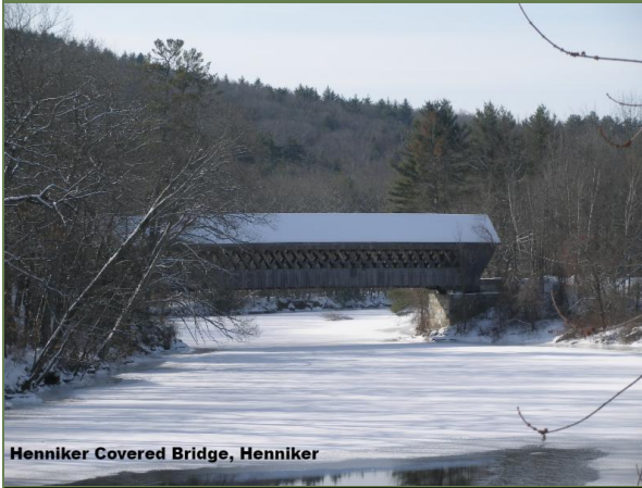
Henniker Covered Bridge, Henniker