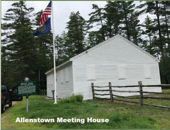
Allenstown Meeting House