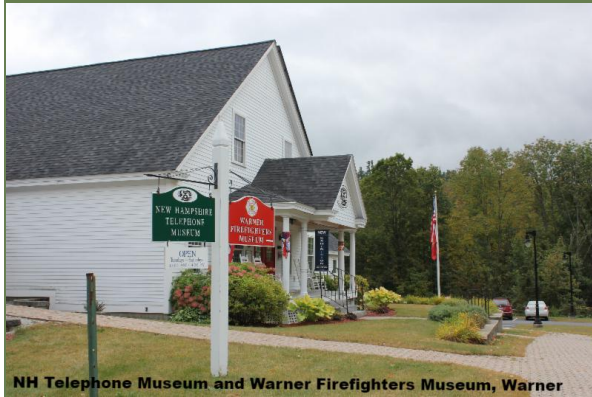
NH Telephone Museum and Warner Firefighters Museum, Warner