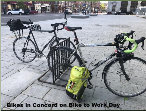
Bikes in Concord on Bike to Work Day