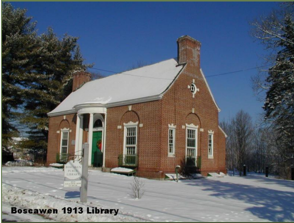
Boscawen 1913 Library