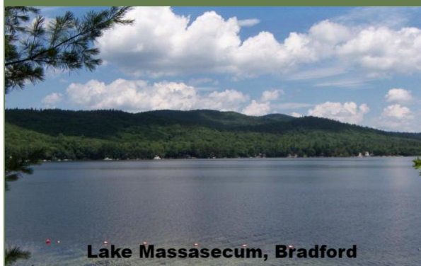
Lake Massasecum, Bradford