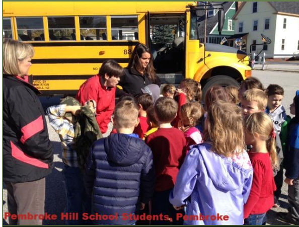
Pembroke Hill School Students, Pembroke