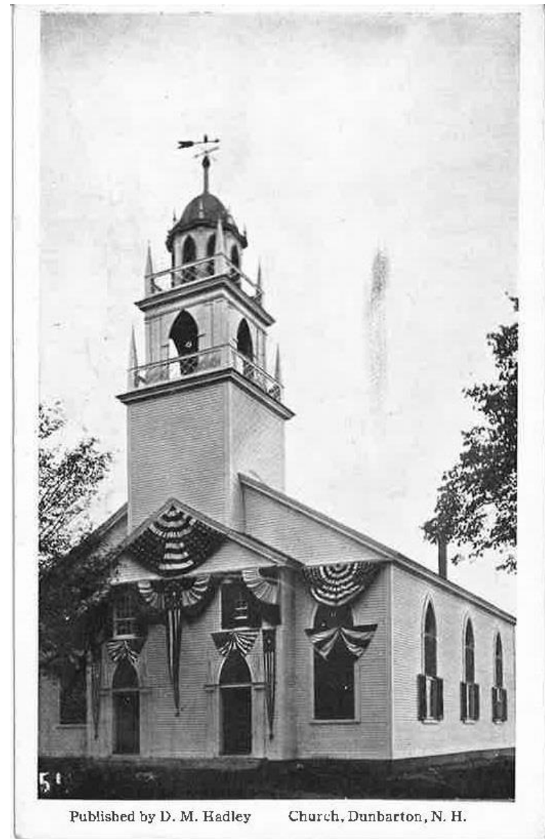
The First Congregational Church, Stark Highway North, Dunbarton

In the Congregational Society’s annual meeting report of March 21, 1832, the Vestry was to be built so that the Congregationalists could have a place to hold their meetings other than the Town Meeting