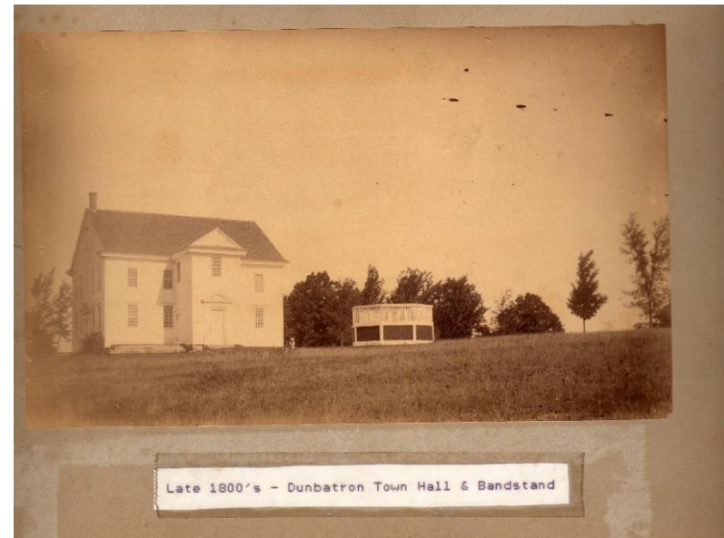
Late 1800's – Dunbarton Town Hall & Bandstand

A bandstand was an active part of community life and spot where the Dunbarton Coronet Band played many times between the years 1882 and 1913. In 2008, a second Town Common bandstand was built with monies raised over the previous seven years; no taxpayer funds were used.