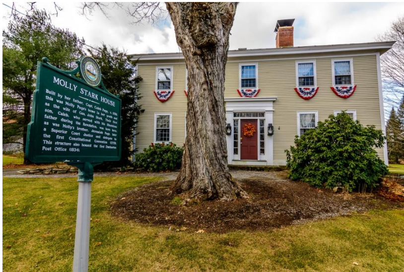
Molly Stark House

The interior and exterior woodwork of these early-nineteenth-century houses is of fine quality. Remarkable in a farming neighborhood, this woodwork reveals the builders' familiarity with the latest architectural styles.