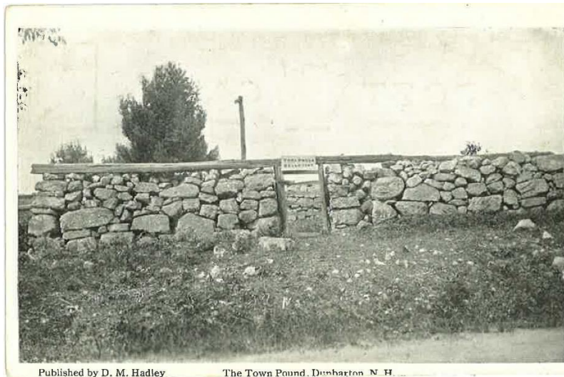
Dunbarton Town Pound, unknown year.

In 1791, the Town voted to build a Town Pound of stone for Town use. The dimensions of the pound were to be 32 feet square inside, 6 feet high of stone and a stack of timber on top with one side flat that locks the corners. The walls were to be 4 feet thick at the bottom and 3 feet thick at the top and built of large stones. The pound was used to contain loose livestock and pets until the owners could claim them.