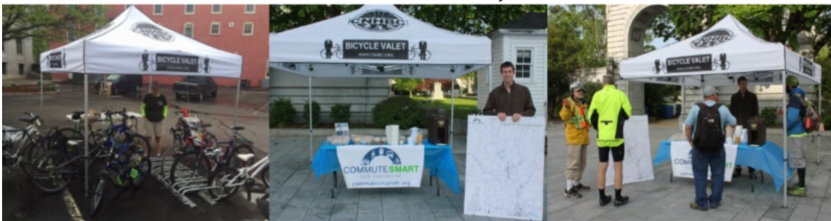
Rock N' Race Bike Valet (L) and Smart Commute Breakfast on Bike to Work Day (C,R)

Several events were held during Bike to Work Week in Central NH, including the Rock N' Race Bike Valet and the Smart Commute Breakfast on Bike to Work Day!