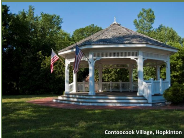
Contoocook Village, Hopkinton